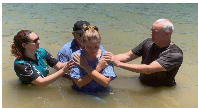
One of the young adults being baptized at Lake Tinaroo at the end of the Alpha Course Camp.