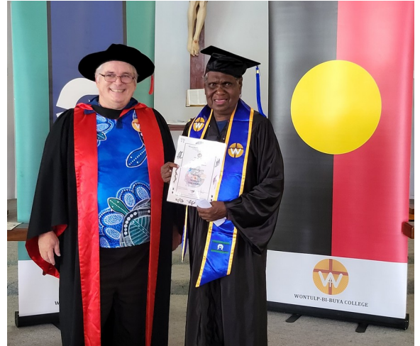
Cert 4 in Theology & Ministry