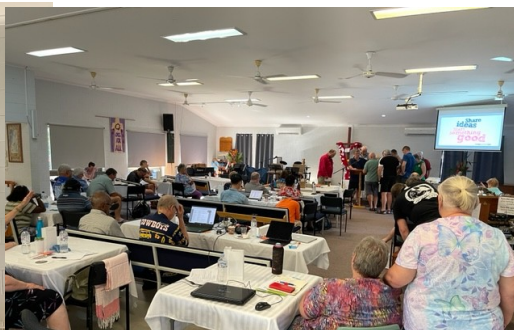
Worship & Prayer