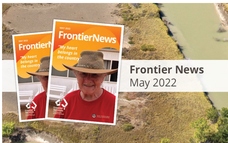
Frontier News May 2022

The May edition is filled with incredible stories of courage, optimism and resilience as Frontier News talks to farmers, Outback Links volunteers and Frontier Services Bush Chaplains on weathering drought, floods, a pandemic and the challenges that come with living and working in the bush.